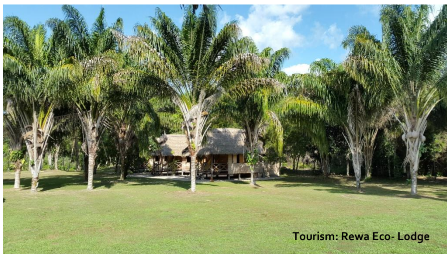
Tourism: Rewa Eco- Lodge