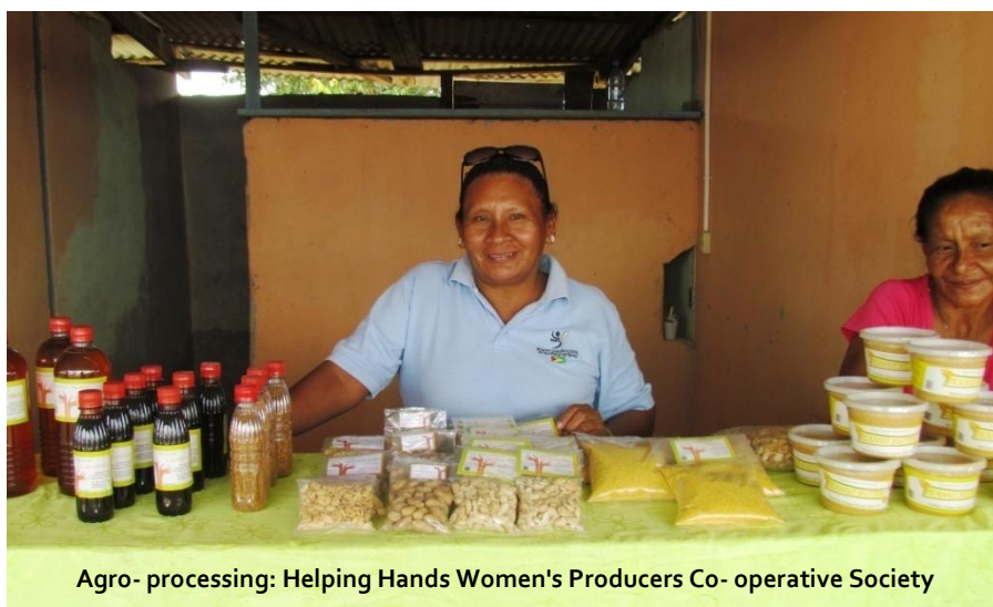
Agro- processing: Helping Hands Women's Producers Co- operative Society