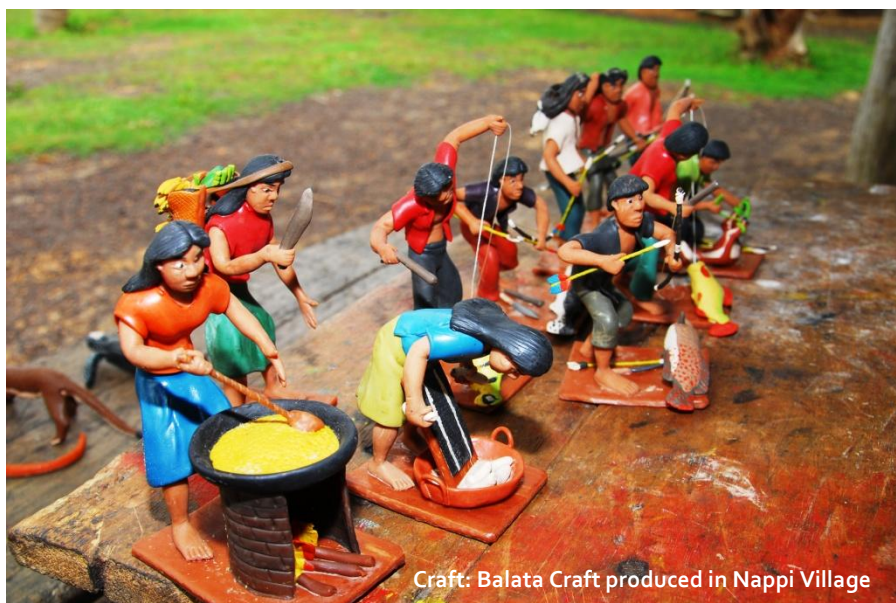
Craft: Balata Craft produced in Nappi Village

The 6% interest rate will be applied with a maximum repayment period of forty-eight (48) months.