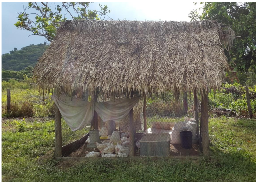
LEVERAGING NATURAL CAPITAL IN GUYANA'S RUPUNUNI